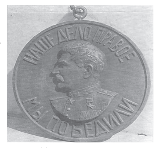
Photo 2: The monument originally included Stalin's image, which was taken down demonstratively during the conflict with the Information Bureau ( Pokrajinski muzej Murska Sobota. Katalog stalne razstave , p. 322.)

A direct consequence of the Cominform conflict was the iron curtain in the east of Prekmurje. All road connections to Hungary were closed. Until 1948, there were as many as 9 border crossings in Prekmurje along the Hungarian state border.15 In the Raba Valley, on the Hungarian side, one consequence was a hysteria of sorts, directed at Tito; preparations for war also included a preventive "cleansing" of the zone bordering with Yugoslavia. Slovenes in Hungary became potential enemies of the Hungarian Communist regime. In Prekmurje, people were worried because of the systematic Hungarization of Slovenes in the Raba Valley. During the population census of January 1949, Slovenes were forced to declare themselves Hungarian. Many