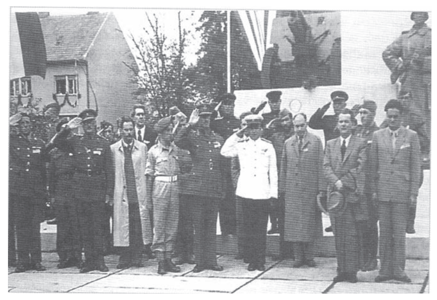
Photo 1: The unveiling of the victory monument on 12 August 1945 ( Pokrajinski muzej Murska Sobota. Katalog stalne razstave , p. 321.)

A direct consequence of the Cominform conflict was the iron curtain in the east of Prekmurje. All road connections to Hungary were closed. Until 1948, there were as many as 9 border crossings in Prekmurje along the Hungarian state border.15 In the Raba Valley, on the Hungarian side, one consequence was a hysteria of sorts, directed at Tito; preparations for war also included a preventive "cleansing" of the zone bordering with Yugoslavia. Slovenes in Hungary became potential enemies of the Hungarian Communist regime. In Prekmurje, people were worried because of the systematic Hungarization of Slovenes in the Raba Valley. During the population census of January 1949, Slovenes were forced to declare themselves Hungarian. Many